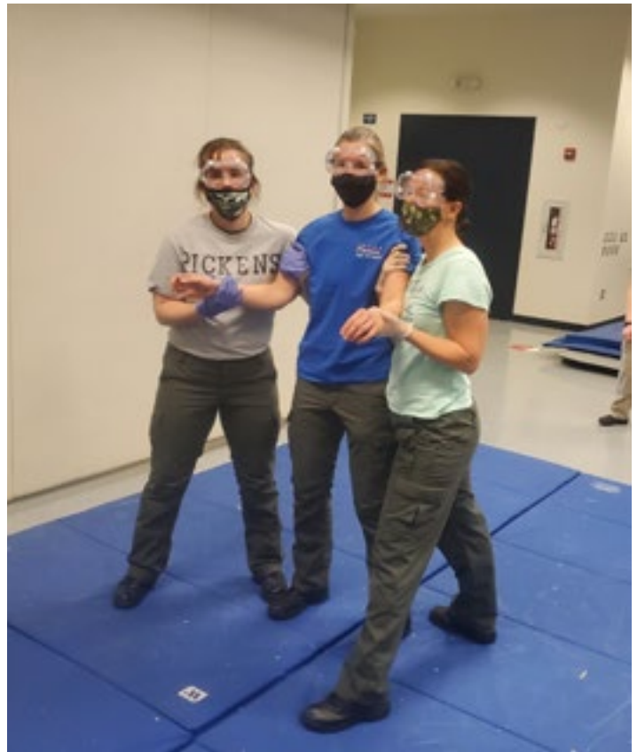
Physical fitness plays a large role in preparing for the demands of the job.