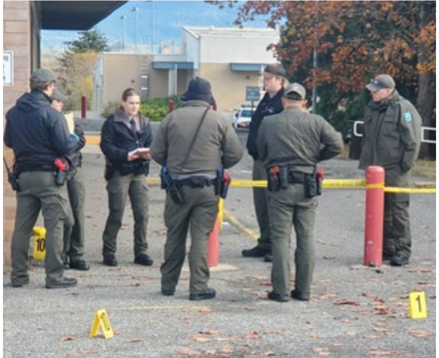
Park Ranger law enforcement academy students at Skagit Valley College practice crime scene investigation skills.