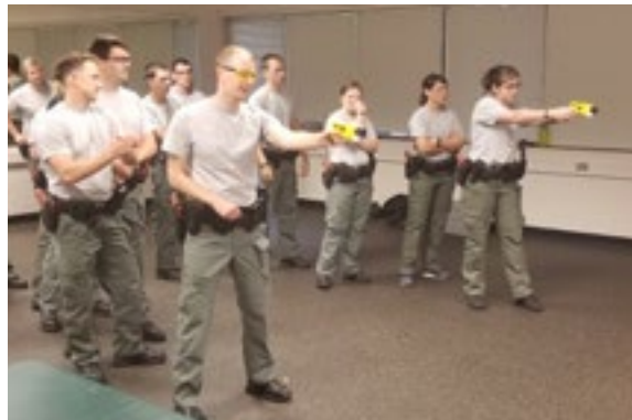
Law enforcement students prepare to be “tased” as part of taser training at Skagit Valley College.

One of the unique aspects of this academy is that it is used by