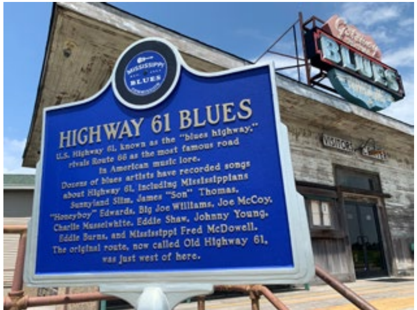
The Mississippi Delta National Heritage Area of the Tunica Blues Museum in Tunica, Miss., embodies the spirit and culture of the area.

Still program critics had their victories. Throughout the 2000s both Democratic and Republican administrations were enticed to recommend that the tiny budget for NHAs be cut (sometimes by