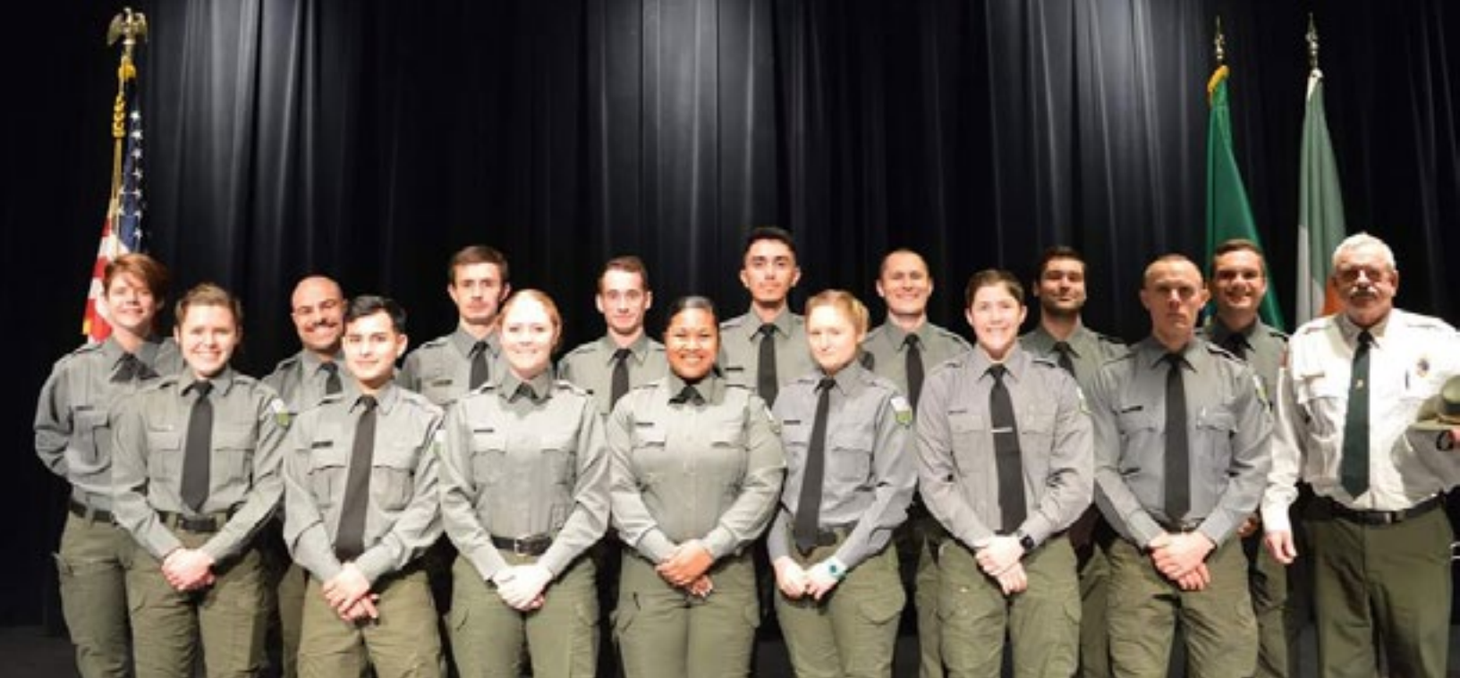
The Skagit Valley College Park Ranger Law Enforcement Academy Fall graduating Class of 2021.