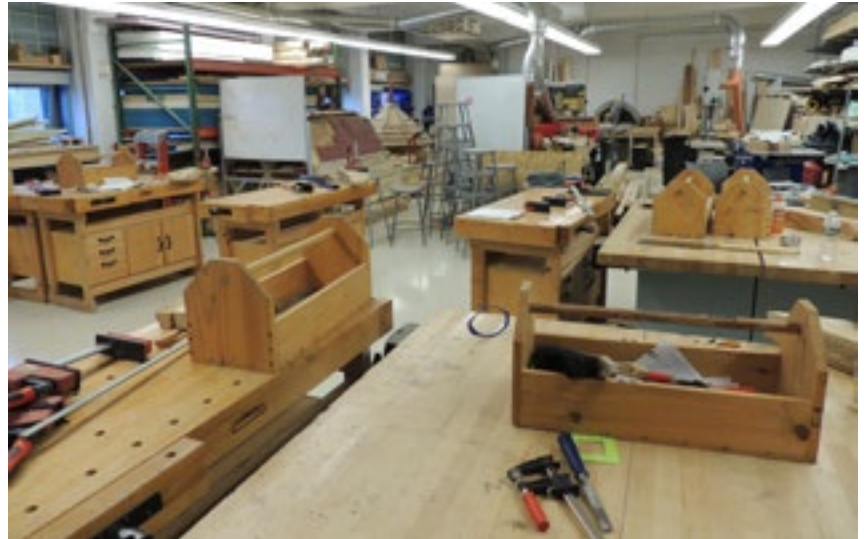
The Stephen T. Mather Building Arts & Craftsmanship High School. It's an independent public school housed in a seven-story building along with at least four other schools in the Hell's Kitchen neighborhood on the West Side of Midtown Manhattan.

WOULD IMAGINE NOT MANY NATIONAL PARK SERVICE EMPLOYEES know there is a high school of which the NPS is a partner. It is named for our first director, Stephen T. Mather. Recently, I visited New York City and toured the Stephen T. Mather Building Arts & Craftsmanship High School. It's an independent public school housed in a seven-story building along with at least four other schools in the Hell's Kitchen neighborhood on the West Side of Midtown Manhattan. The fourth floor is dedicated to the program. This trade school highlights historic preservation programs including carpentry (the wood shop smelled wonderful), masonry, decorative finishes, and landscape management. The school has a work partnership at Governors Island National Monument. Their website is www.matherhsnyc.org/ . I liked one of the quotes I saw "Mather Gather." If you are ever in New York, you might want to check it out. Go Wolves!