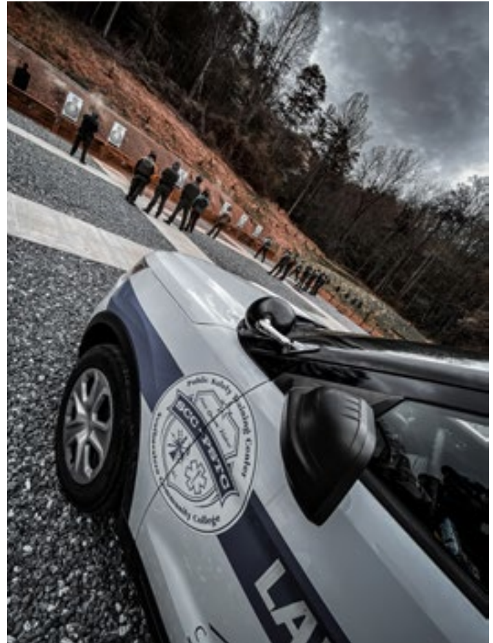
NPS-PRLEA training sessions at Southwestern Community College are delivered twice a year with a maximum class of 24 recruits per training session.

Since 1978, Southwestern Community College has been dedi-